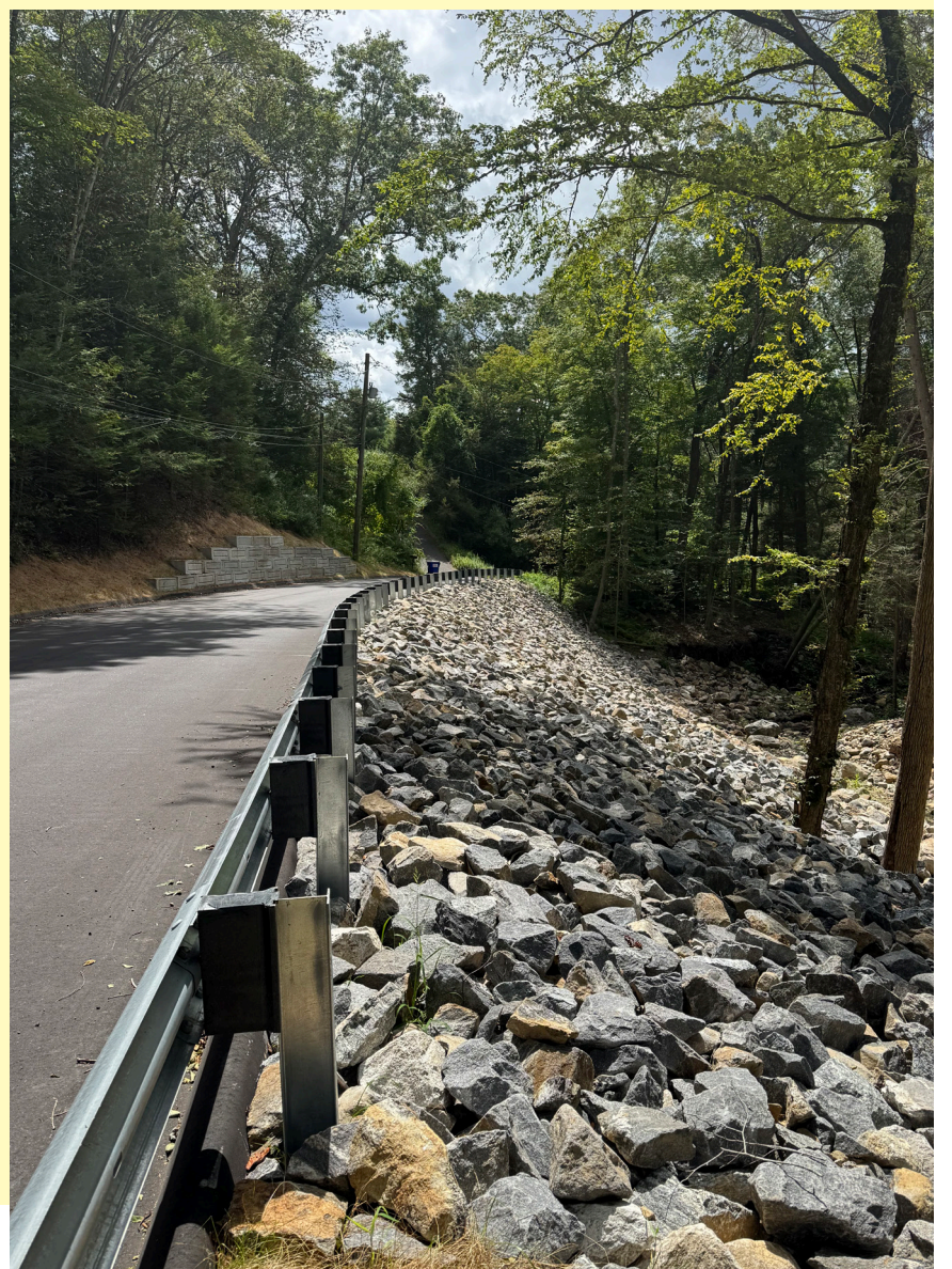
Jackson Cove Rd After