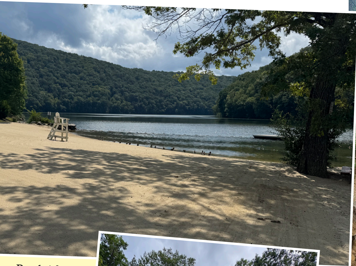
ove Beach After