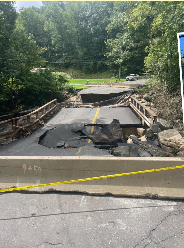
Seth Den Rd. Bridge Before