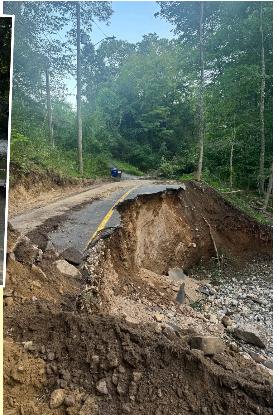
Jackson Cove Rd Before