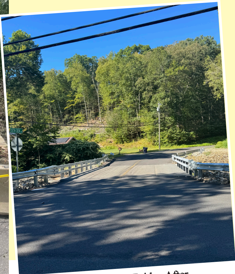
Seth Den Rd. Bridge After