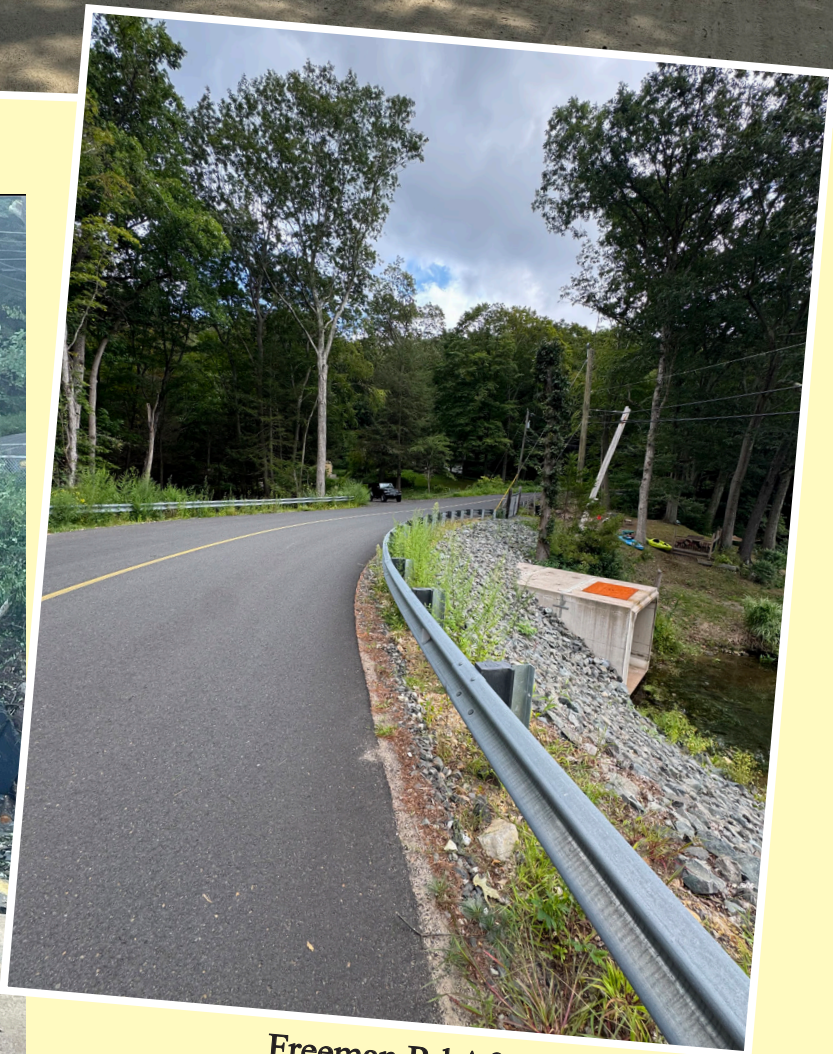
Freeman Rd After