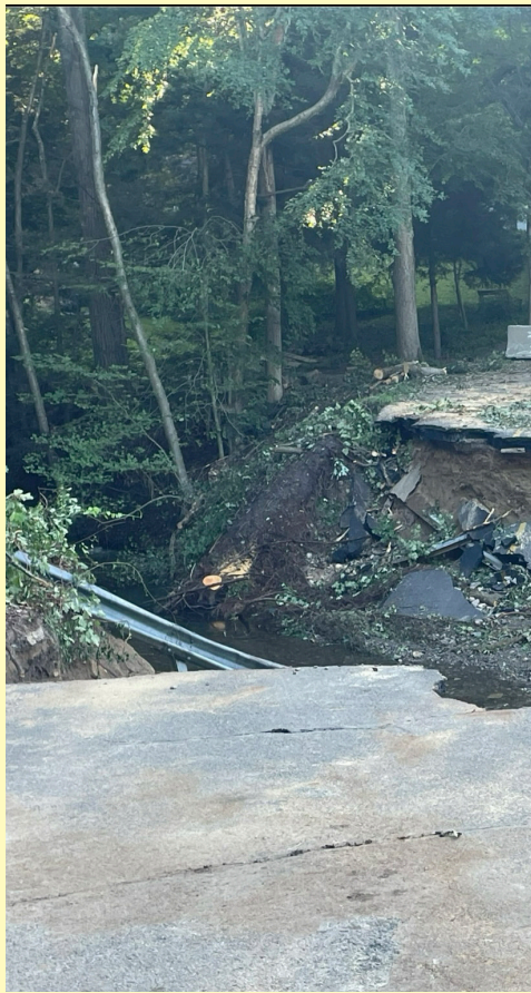
Freeman Rd Before