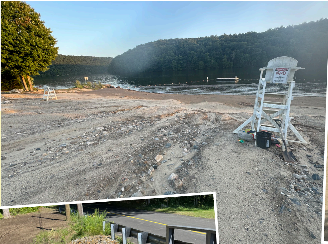
Jackson Cove Beach Before

were crucial in securing the resources and support needed to rebuild. With the guidance of George and Arnie and the capable team they put in place, Oxford has restored its roads, bridges, and The Little River in just one year. Only one road remains closed — Loughlin Road — due to the complexity and location of the damage.